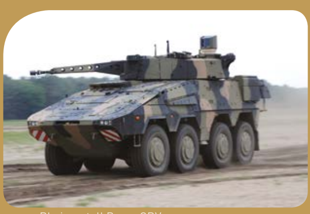
Rheinmetall Boxer CRV